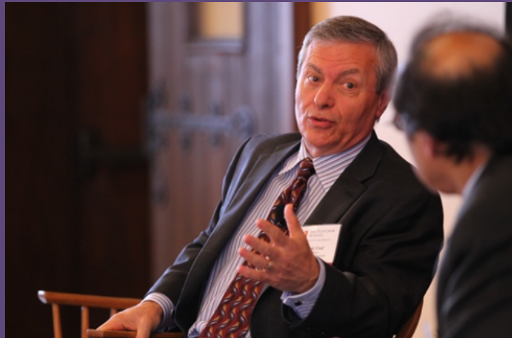
TASSA represented at Fletcher School Conference on Turkey, April 11, 2014