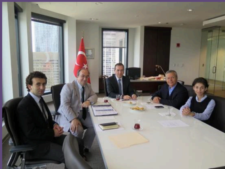
Preparations for TASSA 2016 Conference May 2, 2014