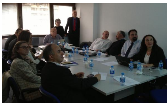
US-TR Delegation, Biomedical Working Group, Ankara April, 2013