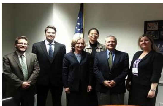
TASSA met US Science Envoy, Dr. Susan Hockfield in Washington DC on April 26, 2013