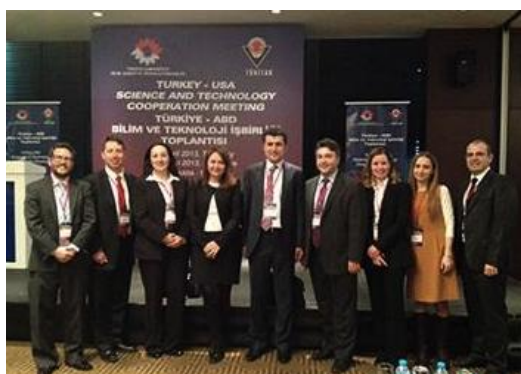
TASSA attended USA-TR Joint Science and Technology Committee Meeting in Ankara April 3-4, 2013