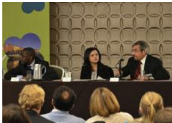
Science and Engineering Diaspora Event In Boston February 14, 2013