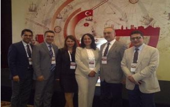
"Summit for Turkish Scientists Living Abroad" meeting in Istanbul July 4-5, 2013