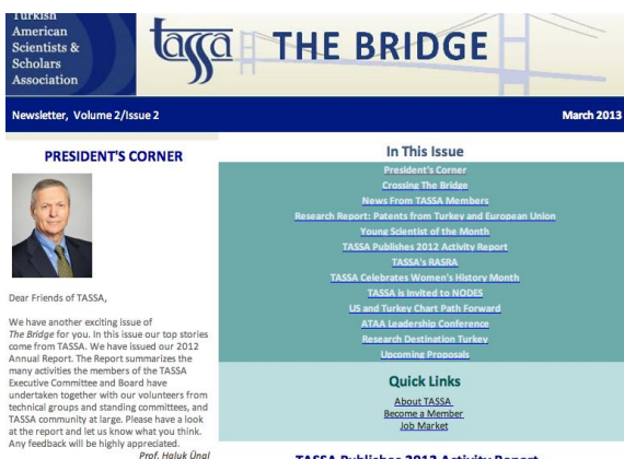
The Bridge, Bi-monthly Newsletter