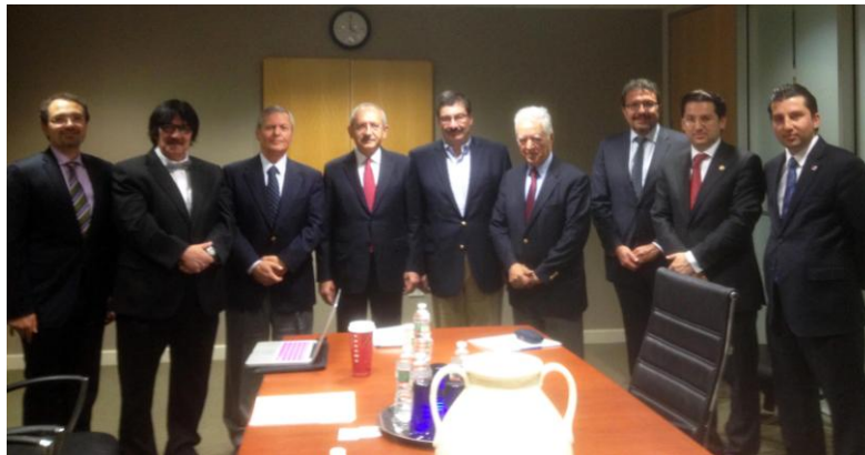
TASSA representatives met with Mr. Kemal Kılıçdaroğlu, the leader of Turkey's main opposition party, the Republican People's Party (CHP) on December 1, 2013