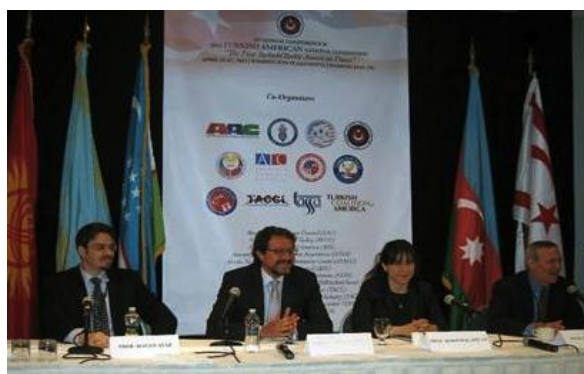
TASSA organized a panel at the ATAA's 33rd Annual Assembly in Washington DC April 25-27, 2013