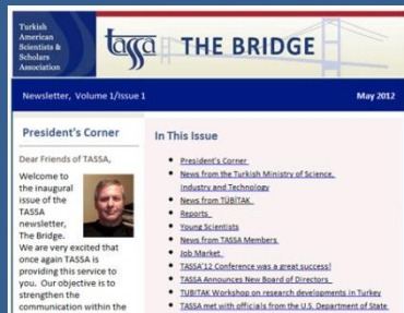
TASSA launches The Bridge , bi-monthly newsletter