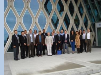
USA-TR Joint Commission Meeting on S & T Cooperation Nov, 1-2, 2012