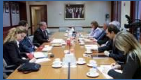
TASSA-TÜBİTAK discussed a road map to make Turkey more attractive for scientists April 9, 2012