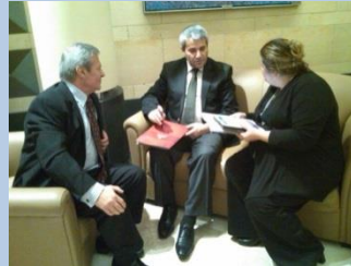
Interview with Science, Industry and Technology Minister of Turkey, May 20, 2012